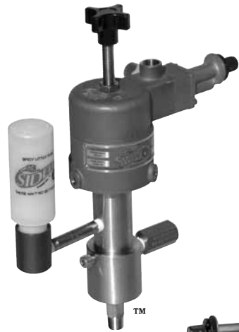
Model 42/62/82 "C"